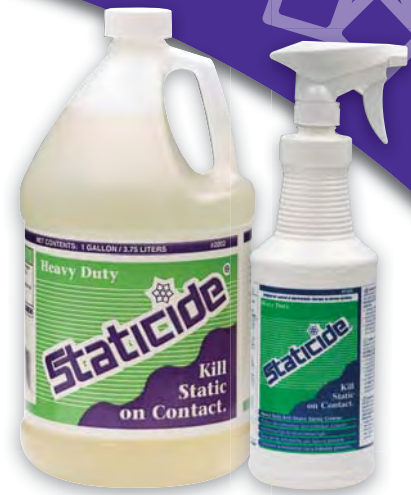
#2002 / 2005

Product #2005: 1-quart bottle / 12 quarts per case (includes trigger sprayer) Product #2002: 1-gallon bottle / 4 gallons per case Product #2002-5: 5-gallon pail Product # 2002-2: 50-gallon drum