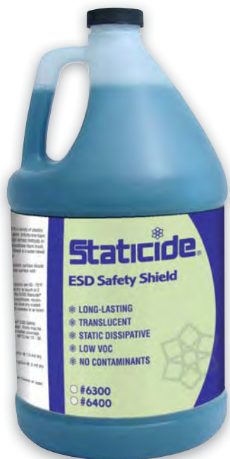
#6300 / 6400

Like our Staticide® Topicals, in the right situation, Staticide® ESD Safety Shield provides a cost-effective solution without sacrificing efficiency and quality. Suitable to use where static interferes with production assembly and ideal to use in static control environments to prevent ESD events. Use on electronic packaging, conveyor parts, and on objects in electronic assembly work areas.