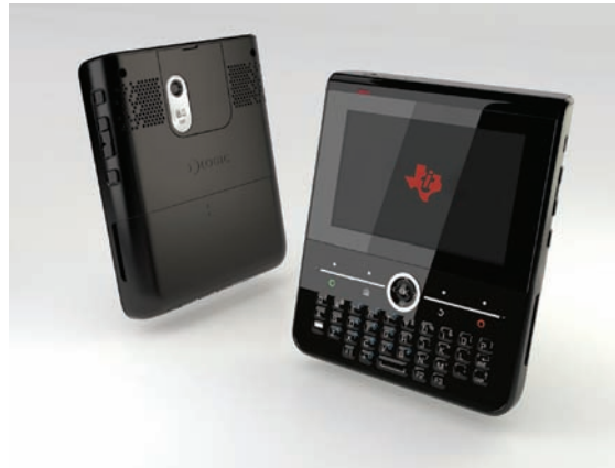
ZOOM OMAP34x-II MOBILE DEVELOPMENT PLATFORM

At the heart of the Zoom OMAP34x-II MDP is Texas Instruments' OMAP3430 applications processor that combines powerful multimedia, graphics, and imaging capabilities with a high-