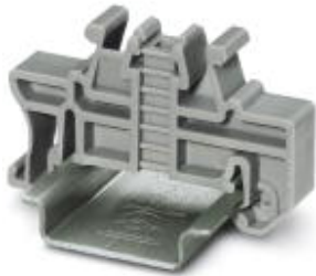
The illustration shows the version in gray

Please be informed that the data shown in this PDF Document is generated from our Online Catalog. Please find the complete data in the user's documentation. Our General Terms of Use for Downloads are valid ( http://download.phoenixcontact.com )